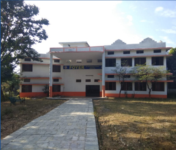
FOYER INTERNATIONAL HOSTEL