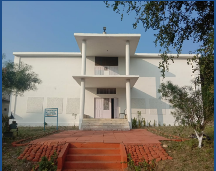
JEFFERSON HOUSE IB MYP SCHOOL