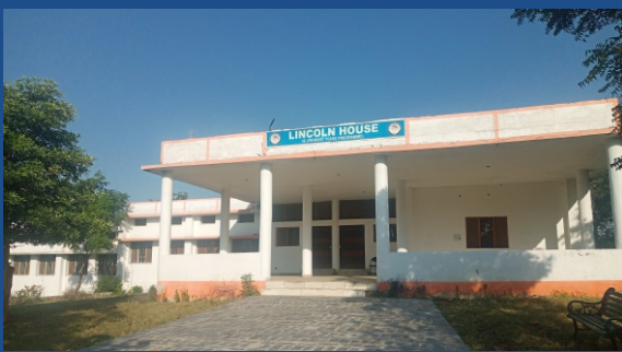
LINCOLN HOUSE IB PYP SCHOOL